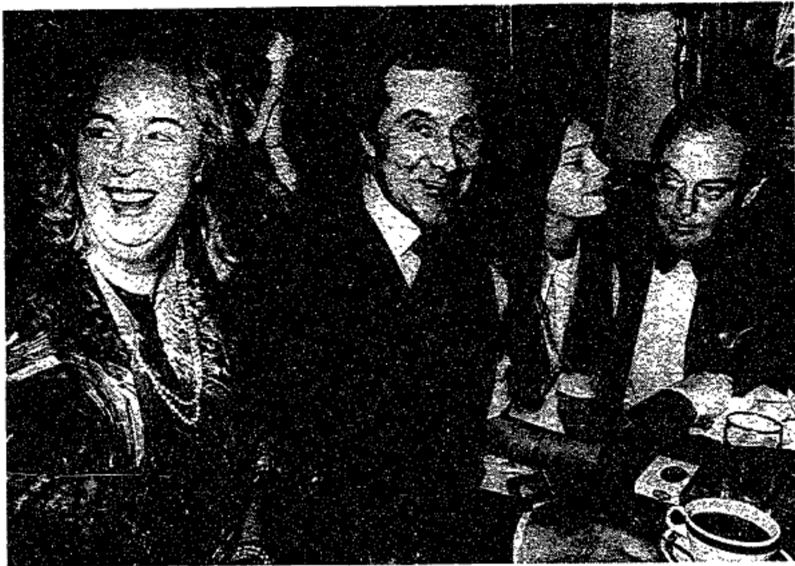
ACTOR PATRICK MACNEE, who is known to TV fans as John Steed of The Avengers series, is back in Toronto to star in Secretary Bird at the Royal Alexan-

Busy with rehearsals, he's had little chance to do more than amble down Prince Arthur Ave. to the Park